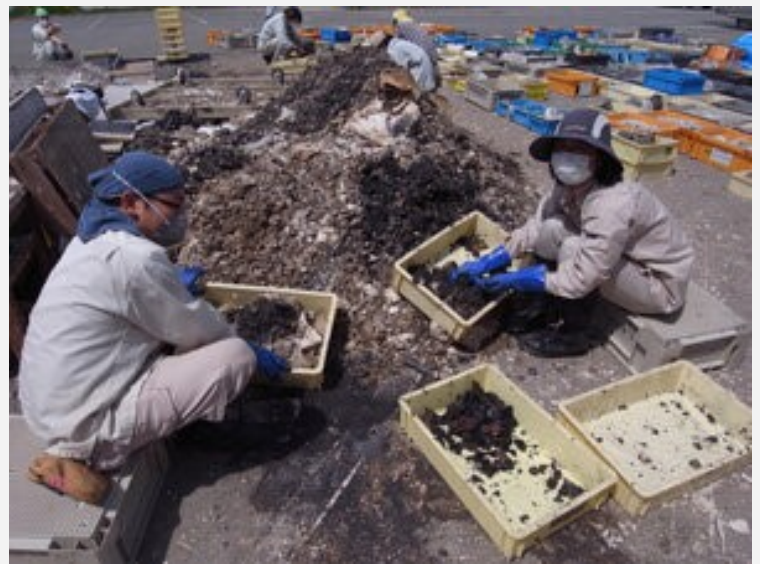
Japanese Studies conference that autumn. Sifting through the debris at Ishinomaki Museum

reconstruction. We in particular wanted to provide a conduit for information about what was happening, which led to a series of meetings and publications. With generous support from the Daiwa Anglo-Japanese Foundation, and in partnership with the Nara National Institute for Cultural Properties and Tohoku University we dispatched a mission of graduate students interested in heritage to the affected region in summer 2012, which led to a special session at the British Association for