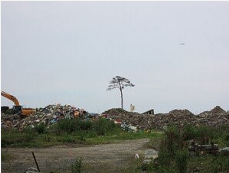
Just one pine tree left standing of the more than 70,000 that originally lined the coast at Rikuzentakada

Just as heritage itself is now often regarded as a process, so it should be with disasters. A further recent major quake off the Tohoku coast was classified as an aftershock of the 2011 quake, a decade on. And of course the emotional, affective role of heritage, so apparent following the Great East Japan Disaster, is increasingly foregrounded elsewhere, as so compellingly demonstrated by the recent Cambridge Annual Heritage Lecture. We have yet to gauge the impact of the current, global pandemic, disaster on heritage around the world but this will also, surely, inform the increasingly sophisticated and reflexive historiography of heritage studies. What is clear is that effective disaster planning and mitigation depend on not forgetting, once the global media gaze has moved on.