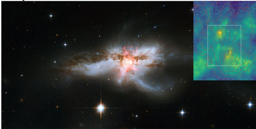
The galaxy NGC 6240, as seen by the Hubble Space Telescope, Credit: NASA. Inset: high-resolution image of the galactic centre, showing the three black holes.

There's no getting around it -- the galaxy NGC6240 looks something of a mess. Rather than having the classic elegant spiral arms, NGC6240 is a chaotic whirl of gas, dust, and stars. Such a galaxy can only be formed from a so-called 'major merger', when two galaxies collide to produce a trainwreck of loops and swirls, testaments to their complex gravitational interactions.