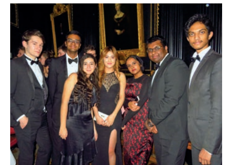
First year medics at the Medical Society Dinner 2020