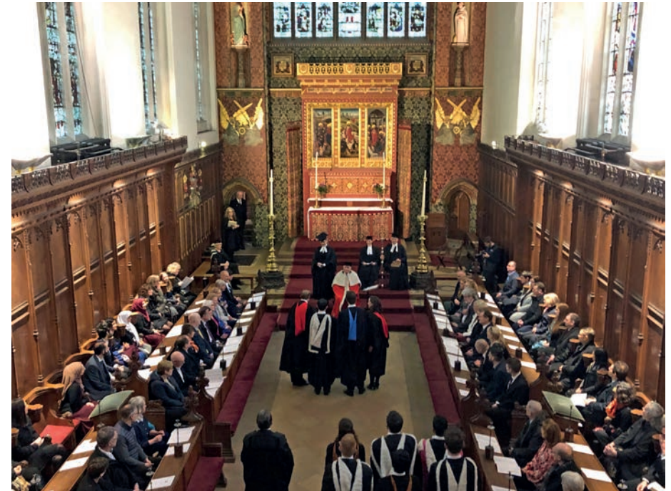
Conferring degrees at a Congregation of Regent House in Queens' Chapel