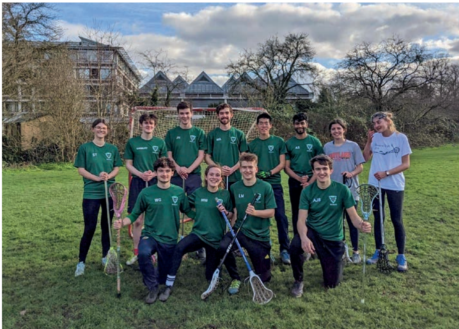
The Lacrosse team