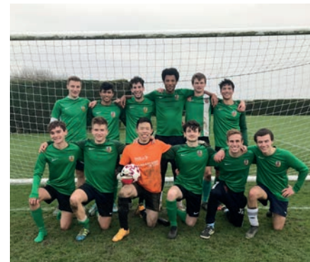
The Men's Football team, who came joint first in this year's Cuppers competition