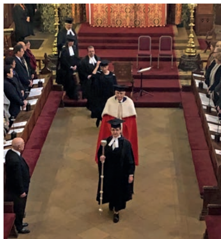
The President as Deputy Vice-Chancellor in procession after the Congregation in Queens' Chapel