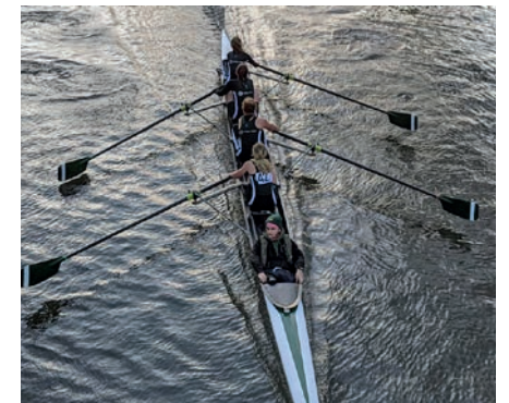
W1 racing to victory in the new G. A. Hayter coxed IV