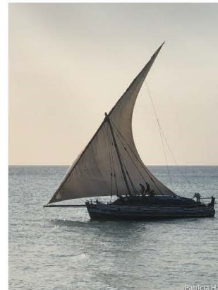
A mashua carrying cargo between the mainland and outer islands.

Like Stone Town, Zanzibar, Pangani has a number of stately, historic 18th and 19th century buildings constructed by African, Omani and Indian merchants, from the proceeds of this flowing trade and commerce.