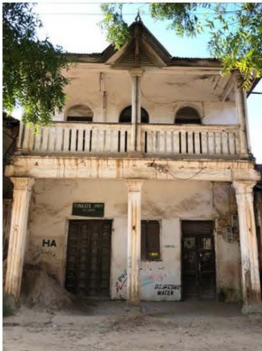
Ornate building in India Street.

Basically there are no funds, locally, to renovate and restore. Even the ornate buildings in India Street, once a thriving commercial area little tainted by the slave trade, lack the business today to keep their shops open.