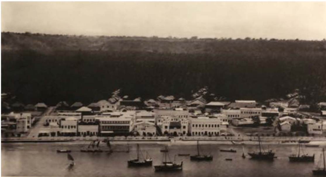
Pangani water-front ca1900

Unlike Stone Town, Pangani is not a UNESCO World Heritage Site, so the buildings are largely crumbling and falling into disrepair.