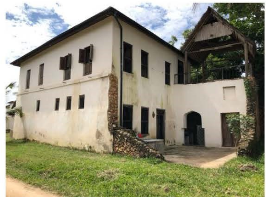
Cultural Centre south and east sides.

international visitors are often unaware of this illustrious past; and the cultural heritage is not presented to its full potential. In collaboration with local communities, Tanzanian scholars and heritage organisations, CONCH strives to raise awareness of Tanzania's rich cultural heritage.